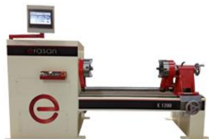
E 1200 B