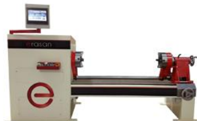
E 1500 B