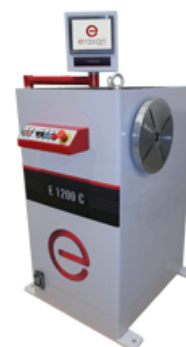
E 1200 C