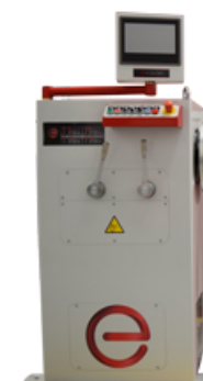
E 1200 C SGB